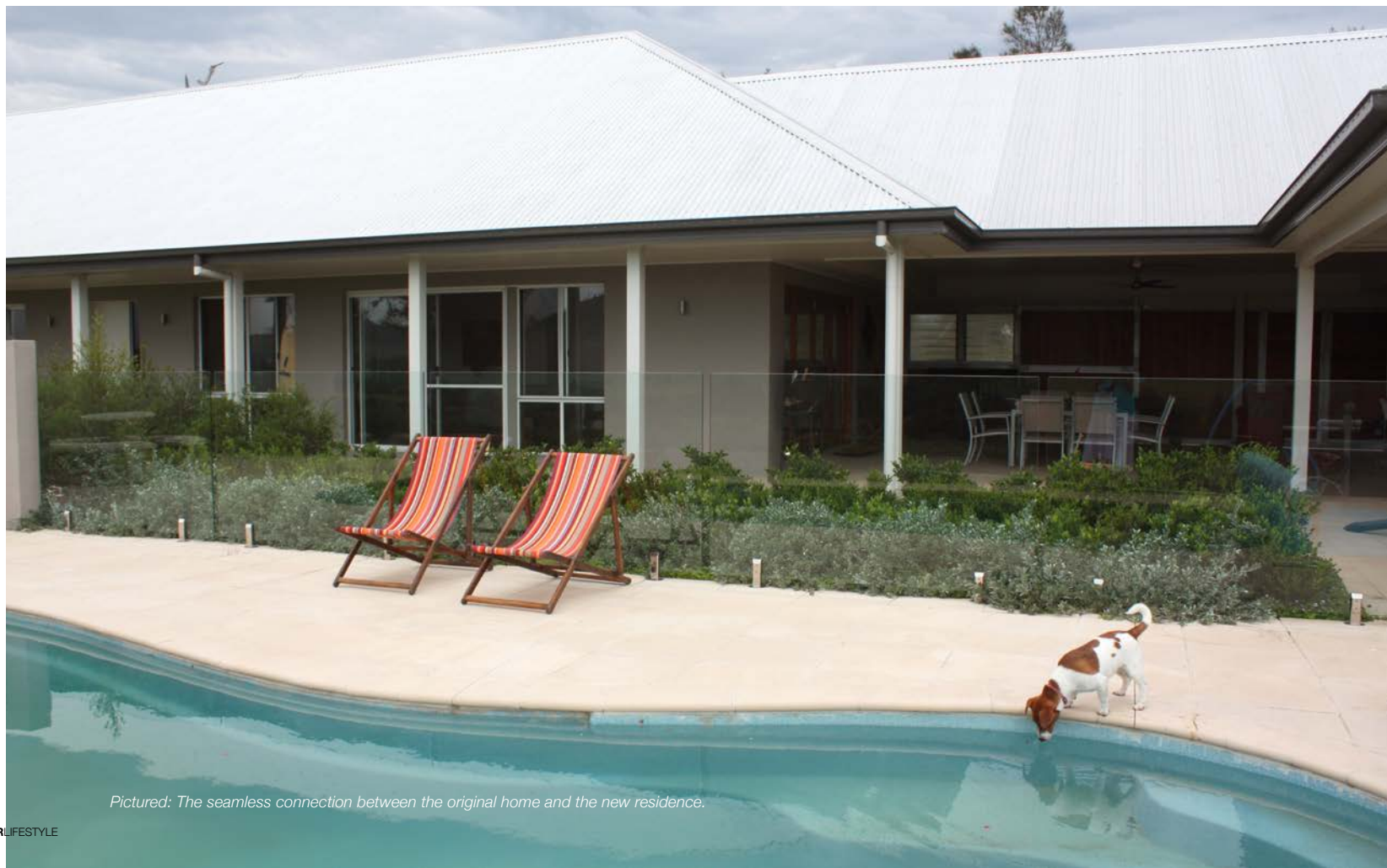
Pictured: The seamless connection between the original home and the new residence.