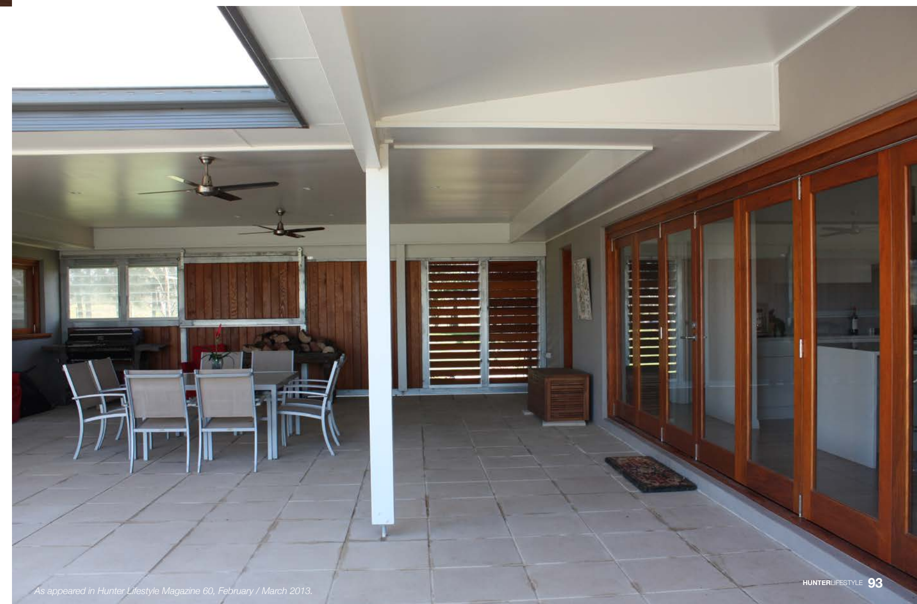
As appeared in Hunter Lifestyle Magazine 60, February / March 2013.

Easy care, clear-finished tongue-and-groove blackbutt flooring flows through the home, with the exception of the carpeted bedrooms and tiled wet areas. The main bathroom is appointed with a Marbletrend Merge freestanding bath and en suite off the master bedroom. Whimsy gloss white rectified wall tiles were chosen for the bathroom and en suite, with Glass Acido feature wall tiles for the bathroom and Cubica Marfill feature wall tiles for the en suite and Coffee Espresso floor tiles for wet areas.