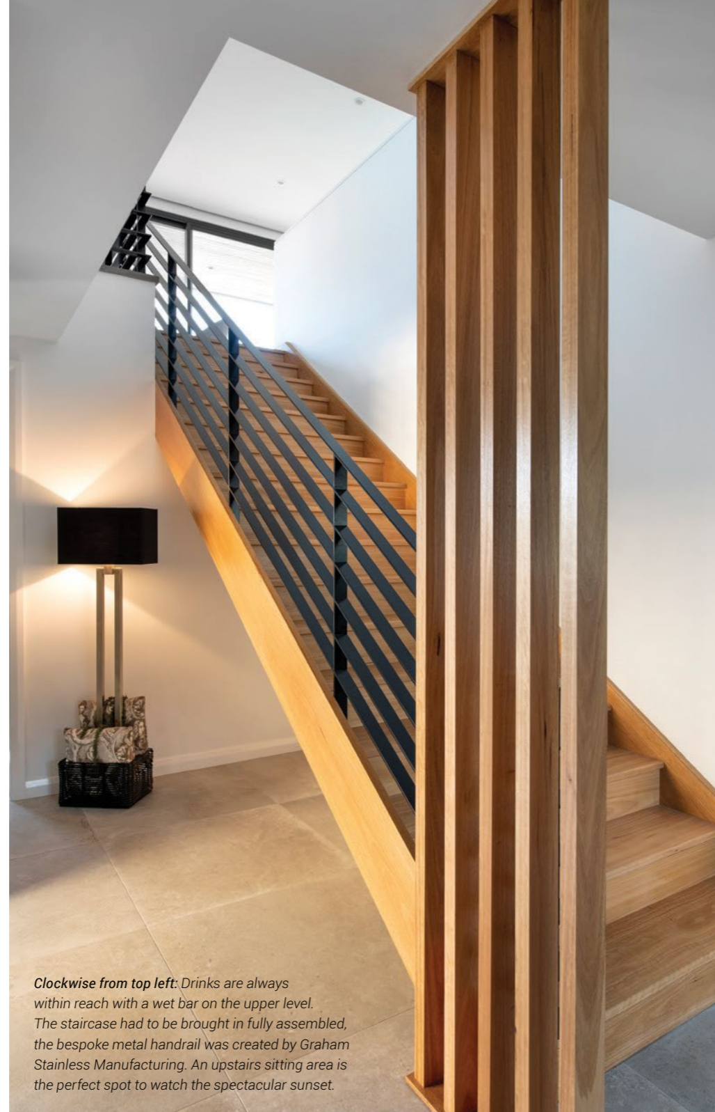
Clockwise from top left: Drinks are always within reach with a wet bar on the upper level. The staircase had to be brought in fully assembled, the bespoke metal handrail was created by Graham Stainless Manufacturing. An upstairs sitting area is the perfect spot to watch the spectacular sunset.

"We have the exact same ones there, just in grey. We started with the artwork which we brought in from our other house and that set the tone for the chairs," Barbara says