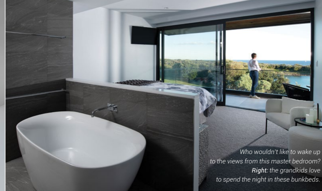
Who wouldn't like to wake up to the views from this master bedroom? Right: the grandkids love to spend the night in these bunkbeds.

This staircase is where Otto von Schnauzer, the couple's schnauzer dog, made his preferences clearly known. ▷