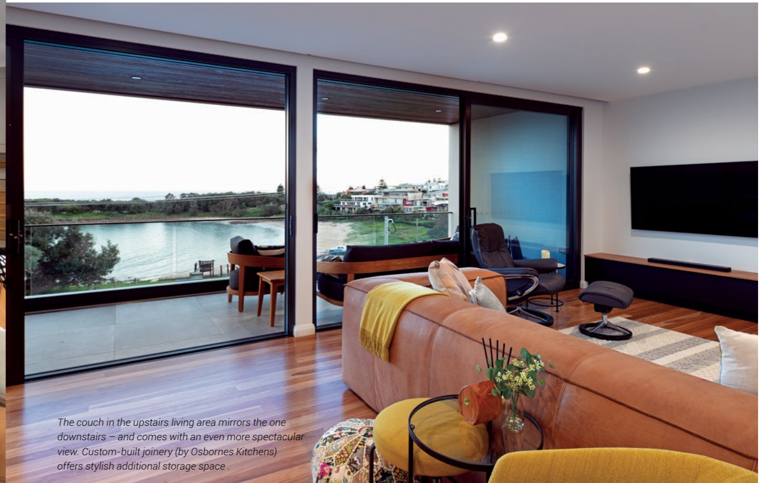
The couch in the upstairs living area mirrors the one downstairs – and comes with an even more spectacular view. Custom-built joinery (by Osbornes Kitchens) offers stylish additional storage space.

you have the best view. But with both the kitchen and the master suite upstairs, why then would we ever spend time downstairs? Besides, an upstairs kitchen just didn't seem right.