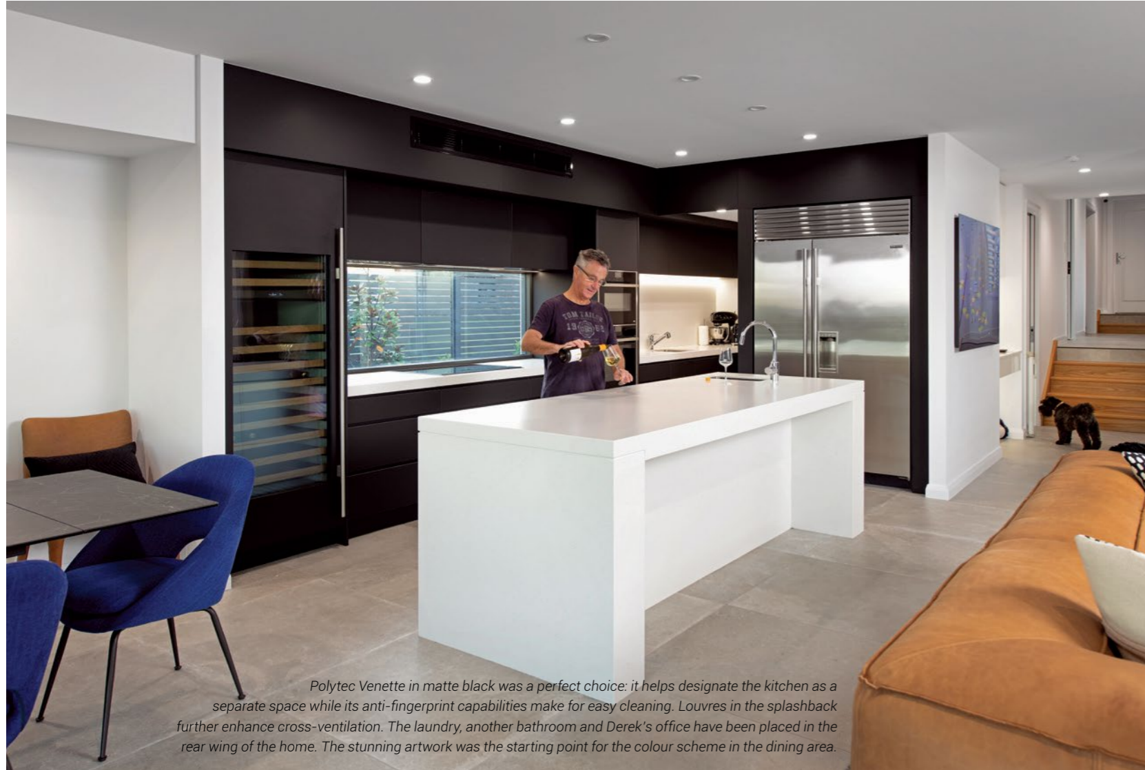
Polytec Venette in matte black was a perfect choice: it helps designate the kitchen as a separate space while its anti-fingerprint capabilities make for easy cleaning. Louvres in the splashback further enhance cross-ventilation. The laundry, another bathroom and Derek's office have been placed in the rear wing of the home. The stunning artwork was the starting point for the colour scheme in the dining area.